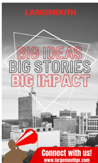
Block Ad Examples

Ads must be submitted with link to corresponding landing page